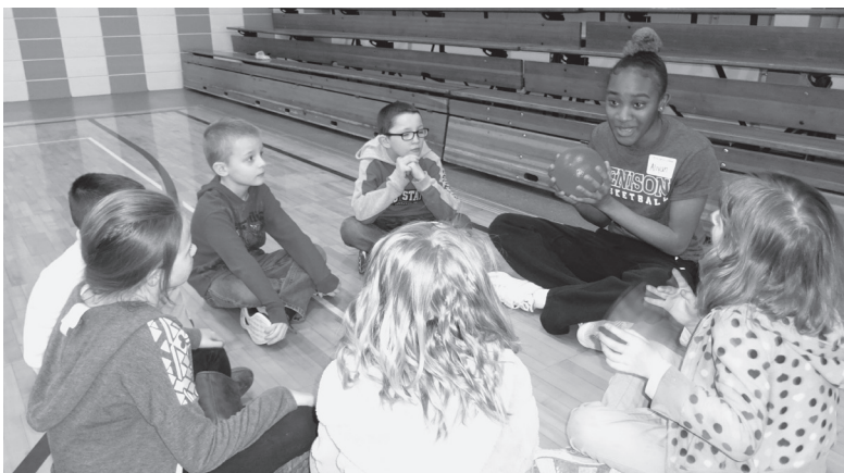
Students at Ben Franklin enjoyed a showcase put on by Denison's Mens and Womens basketball teams. Second graders were reminded by this group of athletes how important it is to be a good student if you want to be an athlete in college.