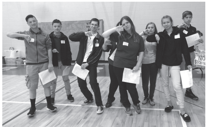
Liberty students let us know how they feel about running out of money during the game. They realize our PEAK phrase is true; The More You Learn, The More You Earn!