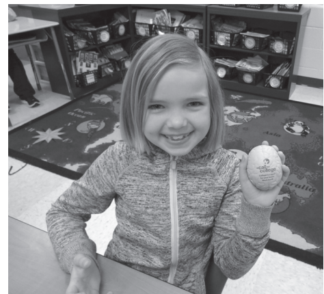
This student from Cherry Valley shows off her special present given to students at the end of the lesson. A stress ball in the shape of a brain!