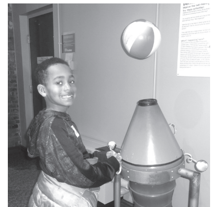
This student is enjoying exploring one of the many wonderful things The Works has to offer as part of the rotation students do on their field trip.

investigation, first floor exploration and a financial literacy lesson. 🦋