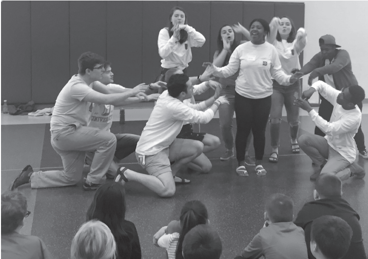
Second graders at John Clem had the wonderful opportunity to learn about A Cappella music and college during a College Comes Into the Classroom event thanks to the Denison student-run singing group, DUwop.